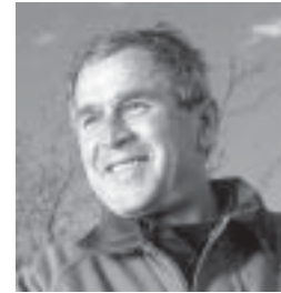
PRESIDENT GEORGE W. BUSH