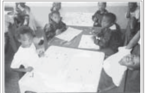
ENGLISH SPEAKING CLASS

The CCNA has put hands and feet to the gospel by feeding and clothing the poverty stricken and children who are literally naked. You are feeding over 500 each month, educating children and providing employment by showing them Jesus.