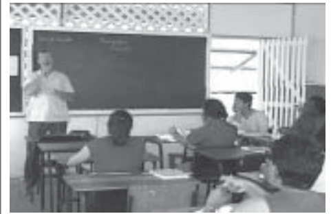
SIGN CLASS AT THE SCHOOL OF THE NATIONS