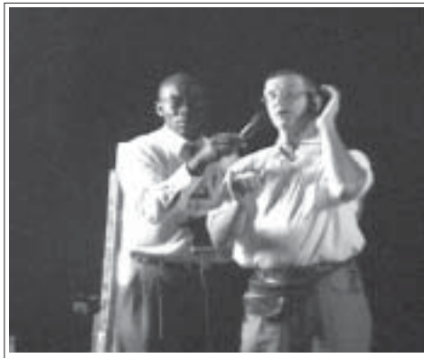
PRAYING AT A LOCAL CRUSADE

The rainy season begins in early May and continue until the end of June. These are the early rains. It rains nearly every day and certainly every night. Some days the rains are so heavy that our yards is flooded. So far the water has not come into the house, praise God!! The blessing is that the temperature is lower. The cooling breezes are welcome. The sad sights are the poor squatters who live on land that is very low-lying. They have flooded yards and houses for weeks at a time. Nearly all the houses are up on concrete blocks or stilts to keep them from becoming flooded.