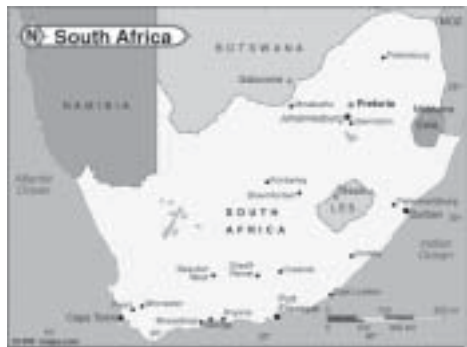
PIETERMARITZBURG, SOUTH AFRICA Site 11: Christian Assembly and New Life Centre