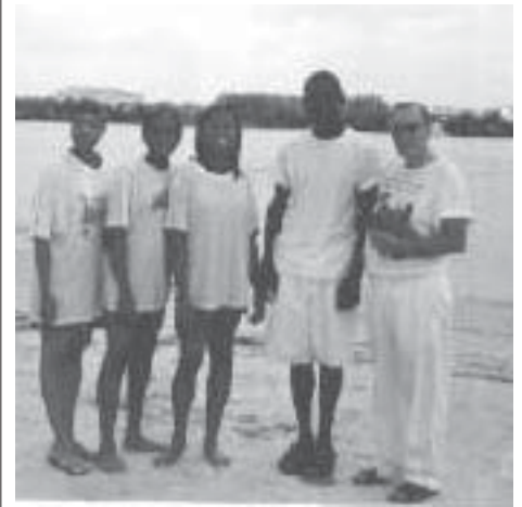
NORTH MIAMI CHRISTIAN CHURCH

God continues to call people out of darkness into His wonderful light. On May 31, we were privileged to baptize another four precious souls. This service was conducted in Miami Beach in the presence of many who witnessed the great joy manifested by the four candidates.