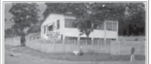
SITE 11 CHRISTIAN ASSEMBLY

While you may not be in South Africa, the effects of your support are felt in the hearts and lives at Site 11. New Life Centre and SITE 11 will continue to tear down the racial and economic barriers that separate us by building a common bridge, which is our HOPE in Jesus Christ.